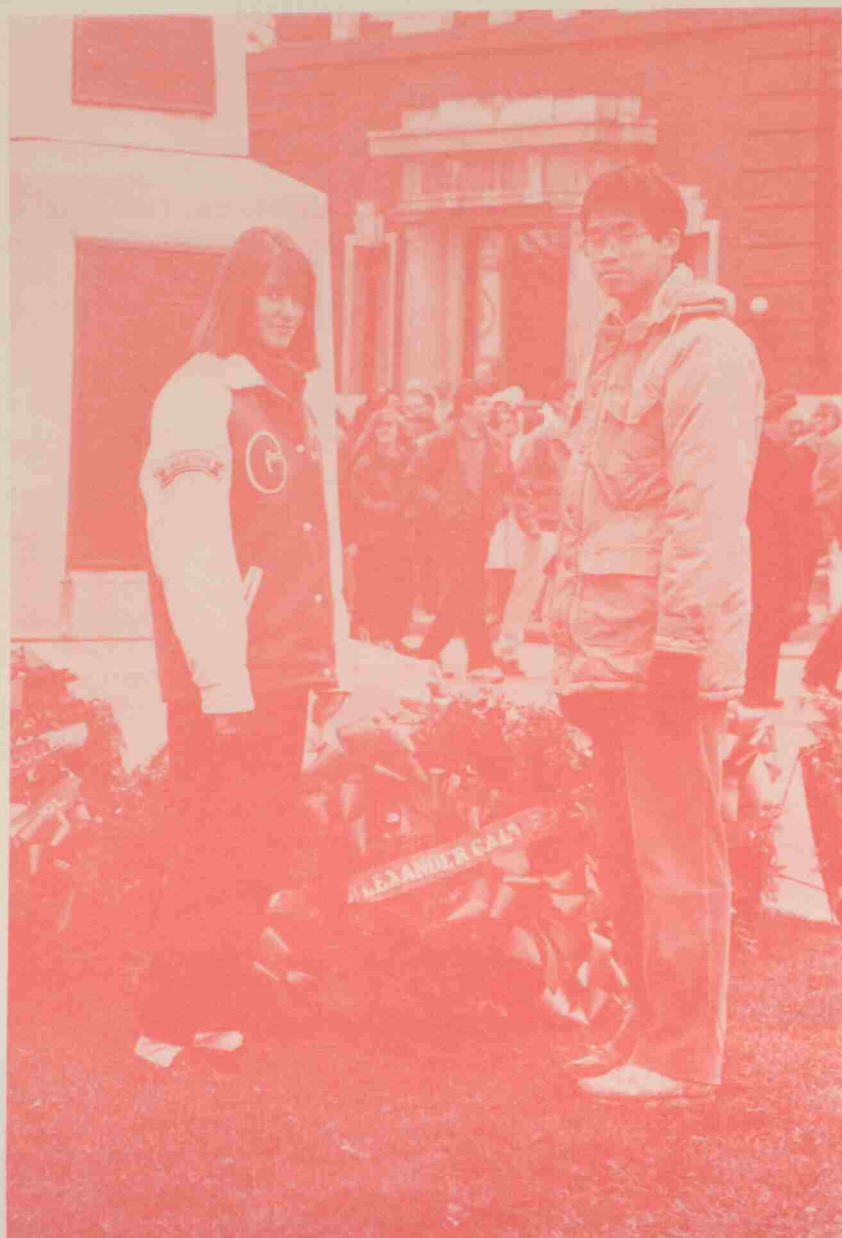
Caption for photograph: