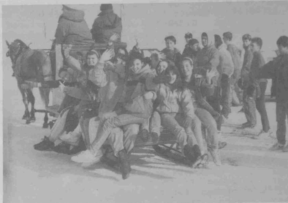
A PILE OF FUN