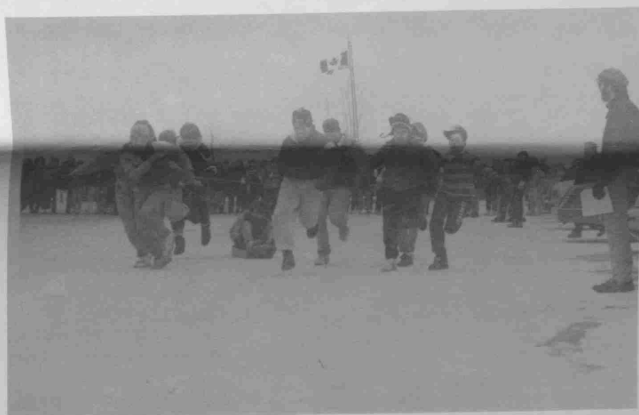
THE GREAT ESCAPE