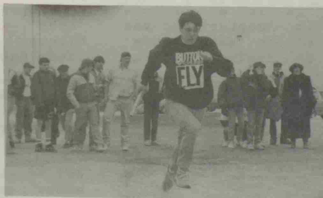
RUN ! DON'T CRY !