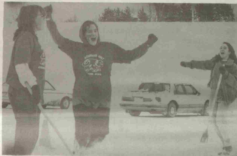
TASMANIAN STATE ANTHEM

soda paint brushes hair phone police truck glasses