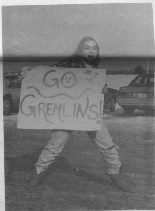
GO GREMLINS ! (THEY WENT)