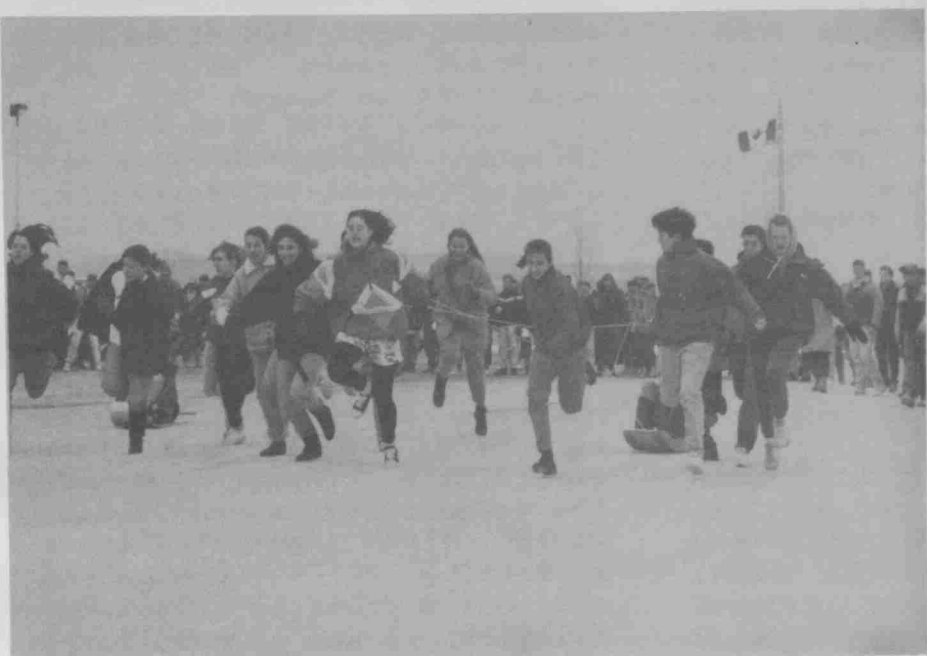
THERE THEY GO !